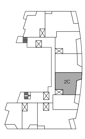
TOWER RESIDENCES KEYPLAN